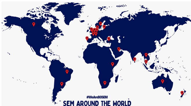
Figure 1 Geographical locations of the contributors to the blog series 'Sport and Exercise Medicine (SEM) Around the World'.

recognised for having high-quality healthcare systems, such as Belgium, Canada, France, Germany, Sweden and Switzerland, have not yet adopted the stand-alone SEM specialty model. Consequently, young physicians desiring to pursue a career in SEM must combine full clinical training in another specialty before additional training in SEM. However, such additional training is often insufficient to reach the level of expertise encountered in other medical specialties. 4